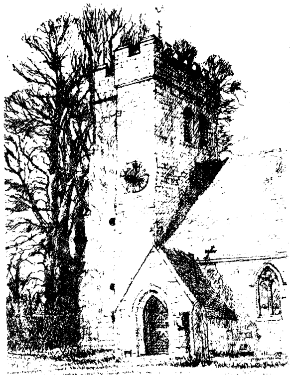
ST. JAMES THE GREAT, ASTON ABBOTS, BUCKS.